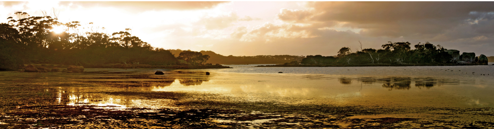
Honeymoon Island, Denmark