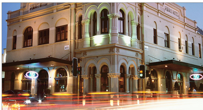
Subiaco Hotel, Perth

Sunflower Vietnamese Restaurant - Croyden Park 08 8340 0880