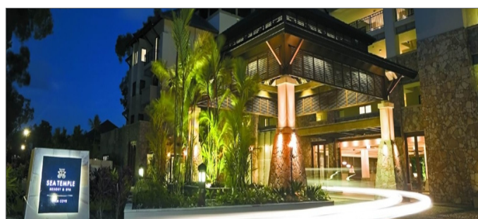
Sea Temple Resort, Port Douglas

The Criterion Hotel - Rockhampton, 07 4922 1225 Sea Temple Resort - 272 Mitre Street, Port Douglas, 07 4084 3500 Palm Bay - Long Island, Whitsundays Red Beret Hotel - 411 Kamerunga Road, Redlynch, 07 4055 1249 Peppers on Queens - 197 Queen Street, Ayr, 07 4783 1700