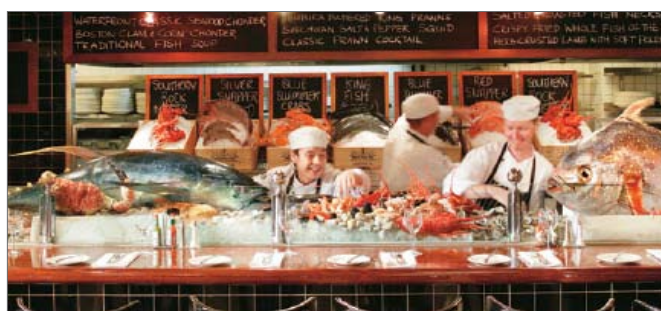
The Waterfront Seafood Restaurant, Crown Casino