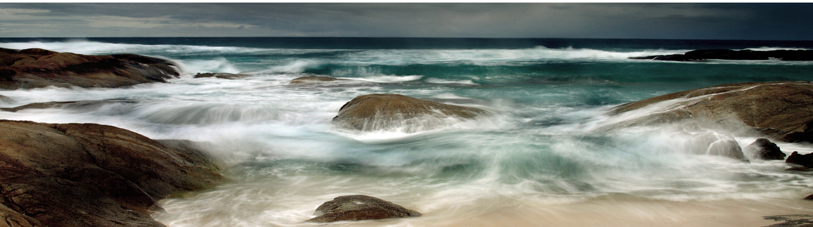
Lights Beach, Southern Ocean, Denmark