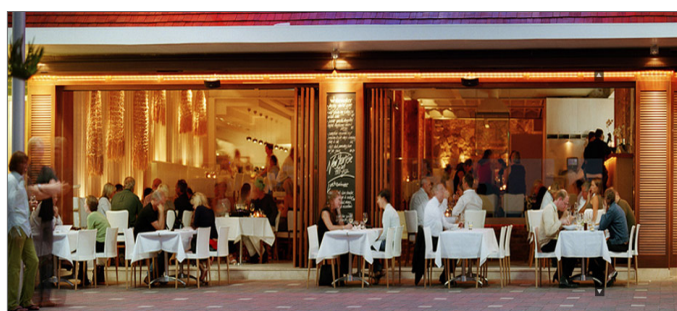
Whitewater, Manly, Sydney

Rendezvous Allegra Hotel - 55 Waymouth St, Adelaide 08 8115 8888 Warradale Hotel - 234 Diagonal Road, Warradale 08 8296 1019 Lime Lemon Thai Café - 89 Gouger St, Adelaide 08 8231 8876 Birkenhead Tavern - 3 Elder Road, Birkenhead 08 8449 6558 Arya Indian Cuisine - North Adelaide Village, 81 O'Connell Street North Adelaide 08 8267 6388